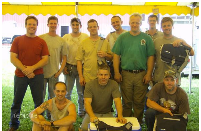
2008 PPFA Forging Contest Competitors