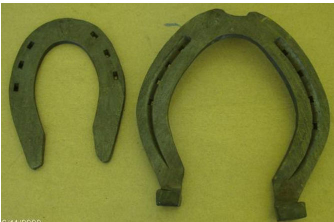
Some of Judge Luke Proulx's specimen shoes from the PPFA's 2008 Forging Contest