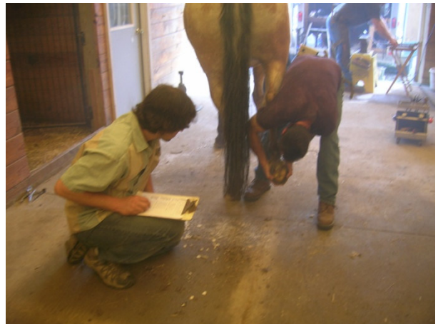
Testers checking out a horse